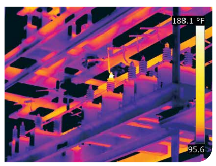
Failing transformer coil against a cold sky